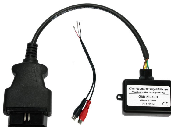
OBD-N5-X-01 coding Dongle